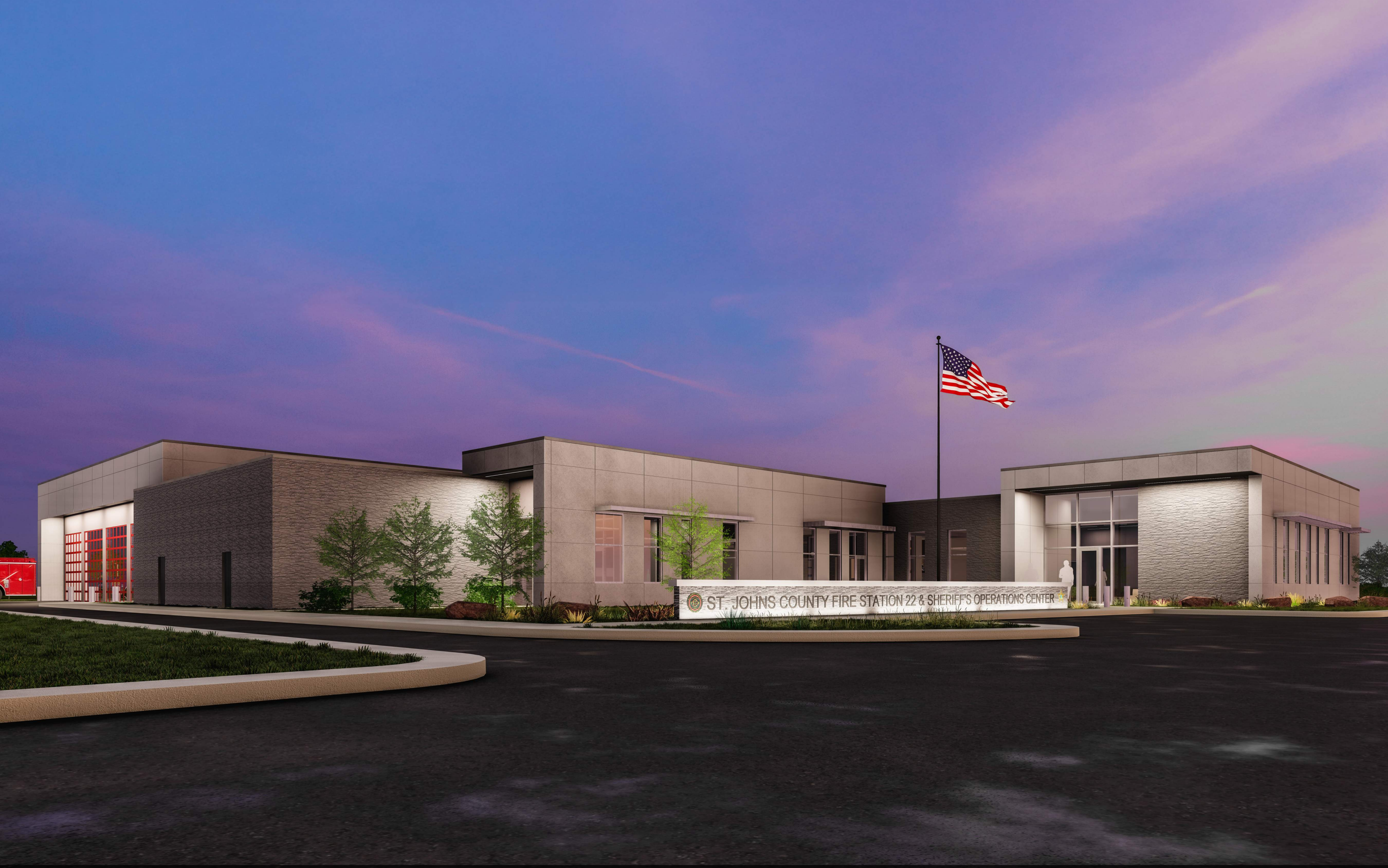
ST. JOHNS COUNTY COMBINED FIRE STATION 22 & SHERIFF'S OPERATIONS CENTER